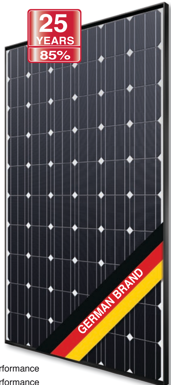
Fig. similar 60M156EN170209A-110/1

Exclusive linear AXITEC high performance guarantee!